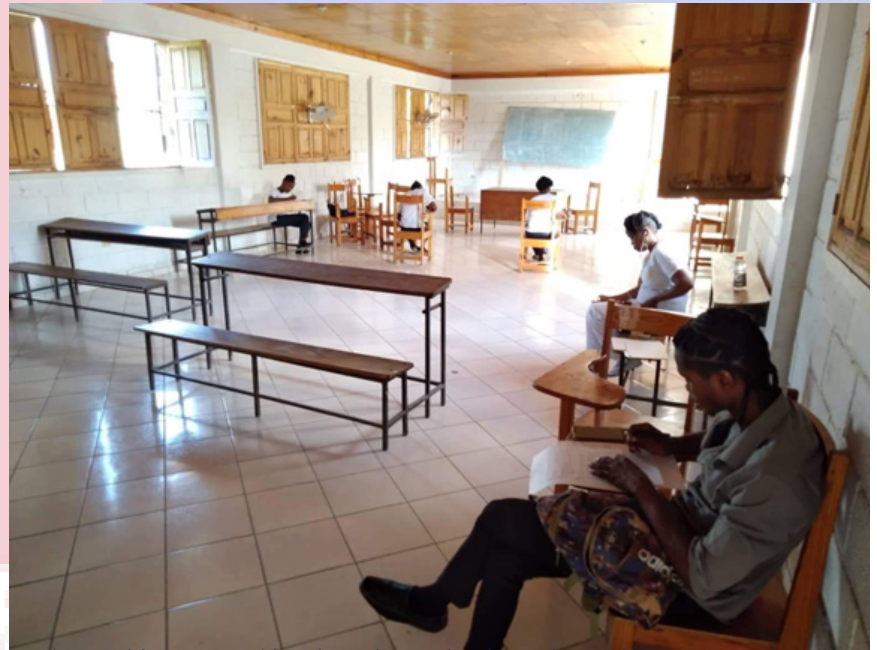
Students taking exams (they have learned to keep the students separated so they are unable to look off each other's work!).