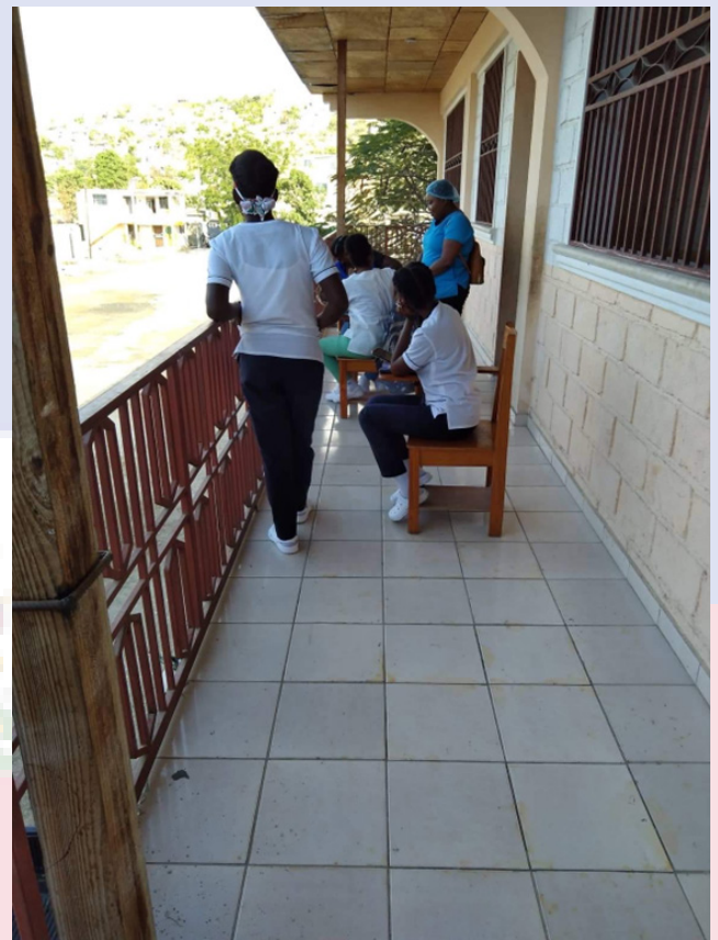
A group of students relaxing and talking after they completed an exam.

We are so thankful God has provided the ability to continue to educate these students despite all the difficulties within Haiti. We praise His work in the lives of the administrators, staff, teachers and students. We pray the Lord protects them, develops them and provides for them. We also pray we would be able to finish some final building construction (a couple support columns need added and temporary wood supports removed) and plumbing for two bathrooms along with maintenance items as God provides. (The school is developing a list of what needs accomplished in the meantime.)